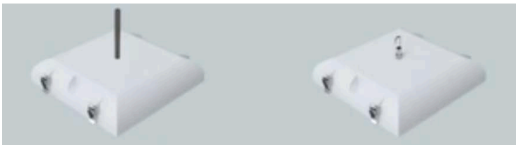
1. Pendant Mount