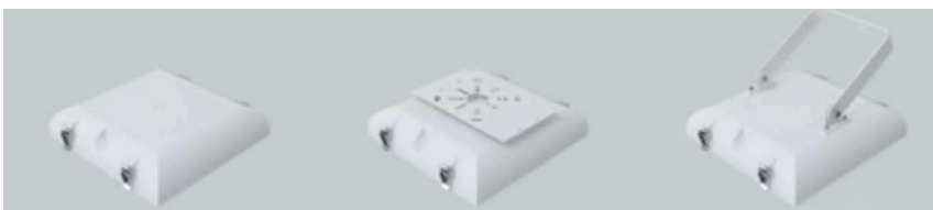
3. Surface Mount